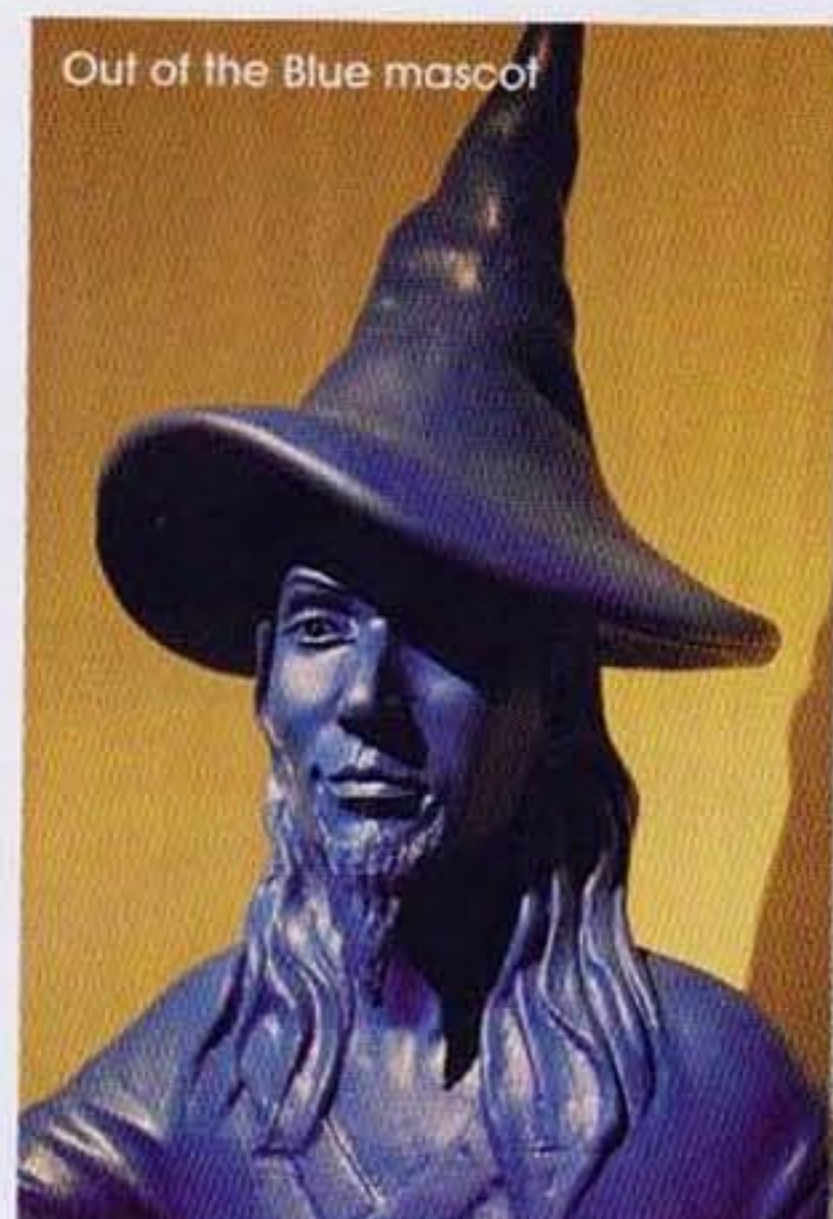
Out of the Blue mascot