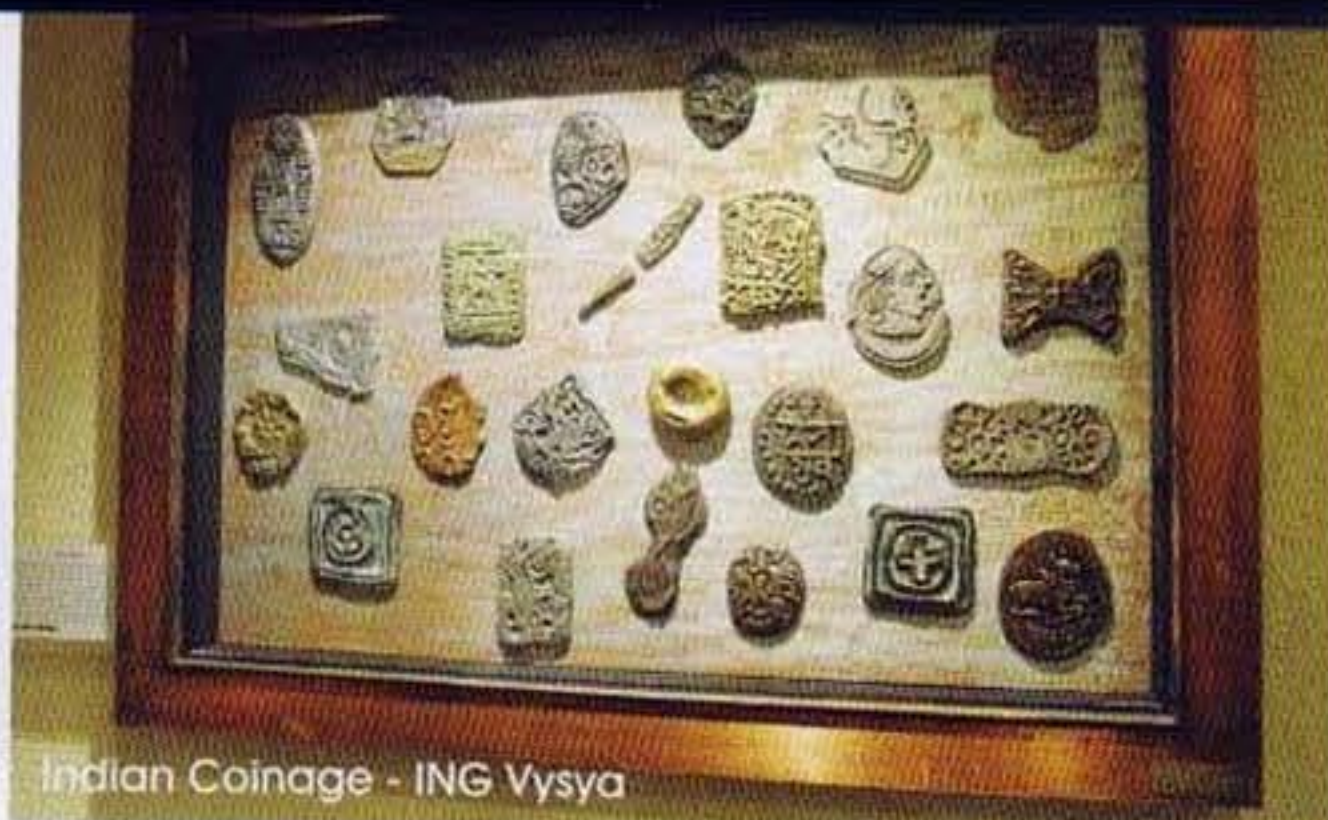
Indian Coinage - ING Vysya