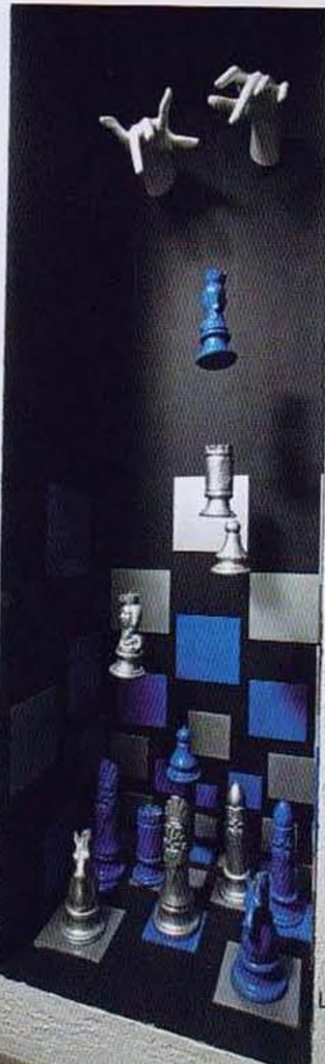
Le Sutra Hotel - outside niche maya-room