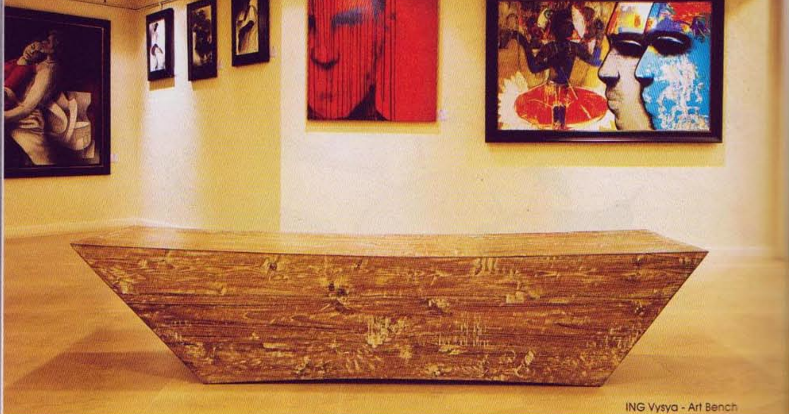
ING Vysya - Art Bench