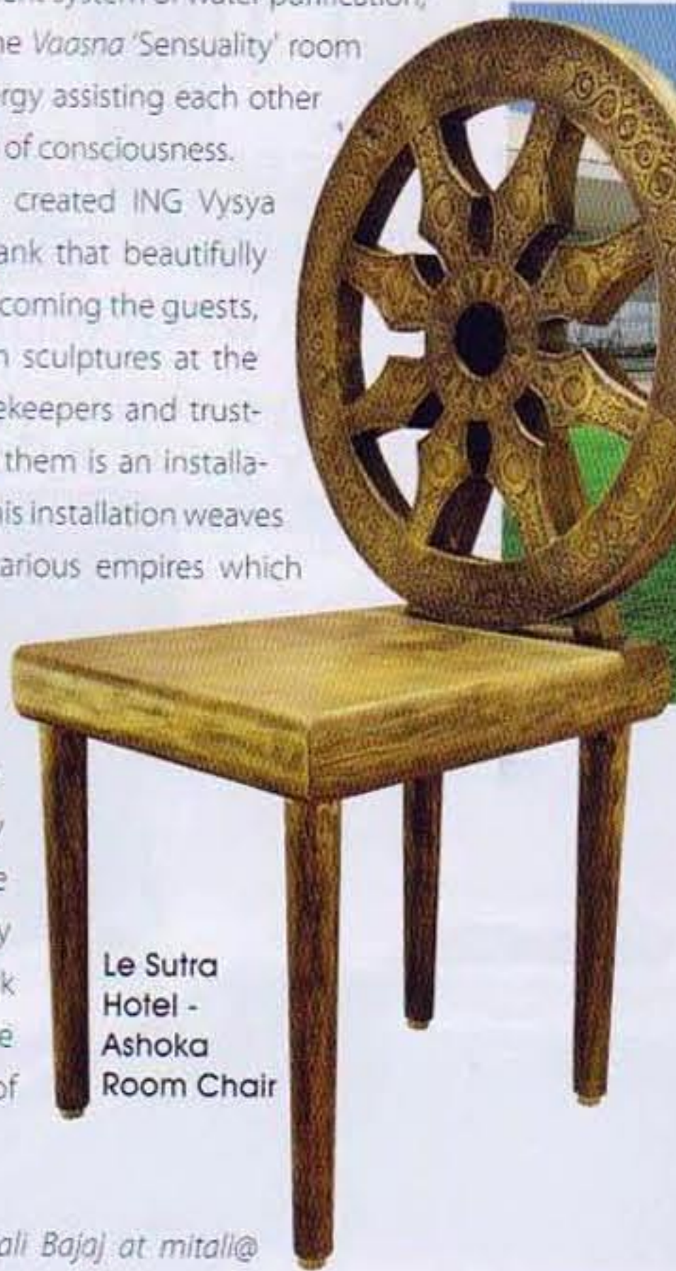
Le Sutra Hotel - Ashoka Room Chair

Dr. Art+Design has also created ING Vysya Bank, the World's first Art Bank that beautifully merges banking with art. Welcoming the guests, are two 6-feet tall iconic lion sculptures at the entrance acting as royal gatekeepers and trustworthy guardians. Following them is an installation of historic Indian coins. This installation weaves a texture of legends from various empires which ruled India since Indus Valley Civilization, through medieval era, till the Mughal reign. Positioned centrally, the barter column shows history of the Barter System before invention of electronic money as we see it today. The artwork narrates the Barter story in the form of doodles by inclusion of figurines and texts.