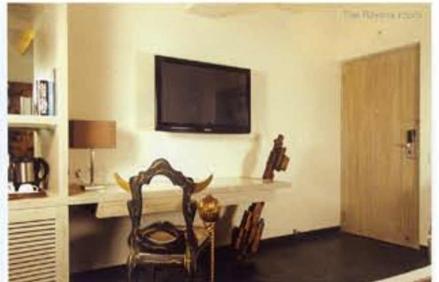
The Nirvaan room