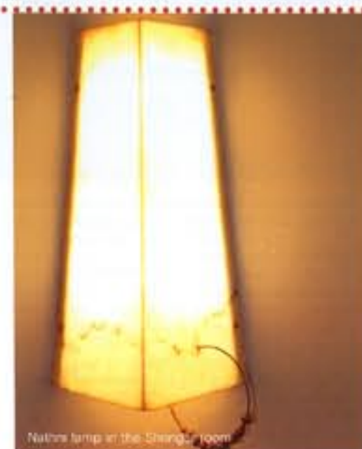
Natura lamp in the Shringar room

flower sculpture, playground sets in geometric shapes and cantilevered 'not-reserved' benches. Interior décor for the Indian Art Café, a sculpture for ACC Ltd, hotel and resort and residential concepts and interiors along with sculptures, products and décor are handled by D.A.D. Believing good design to be a blend of both aesthetics and function, Mitali Bajaj prides in her team of creative minds that incorporate both aspects of function and design right from conception. ■