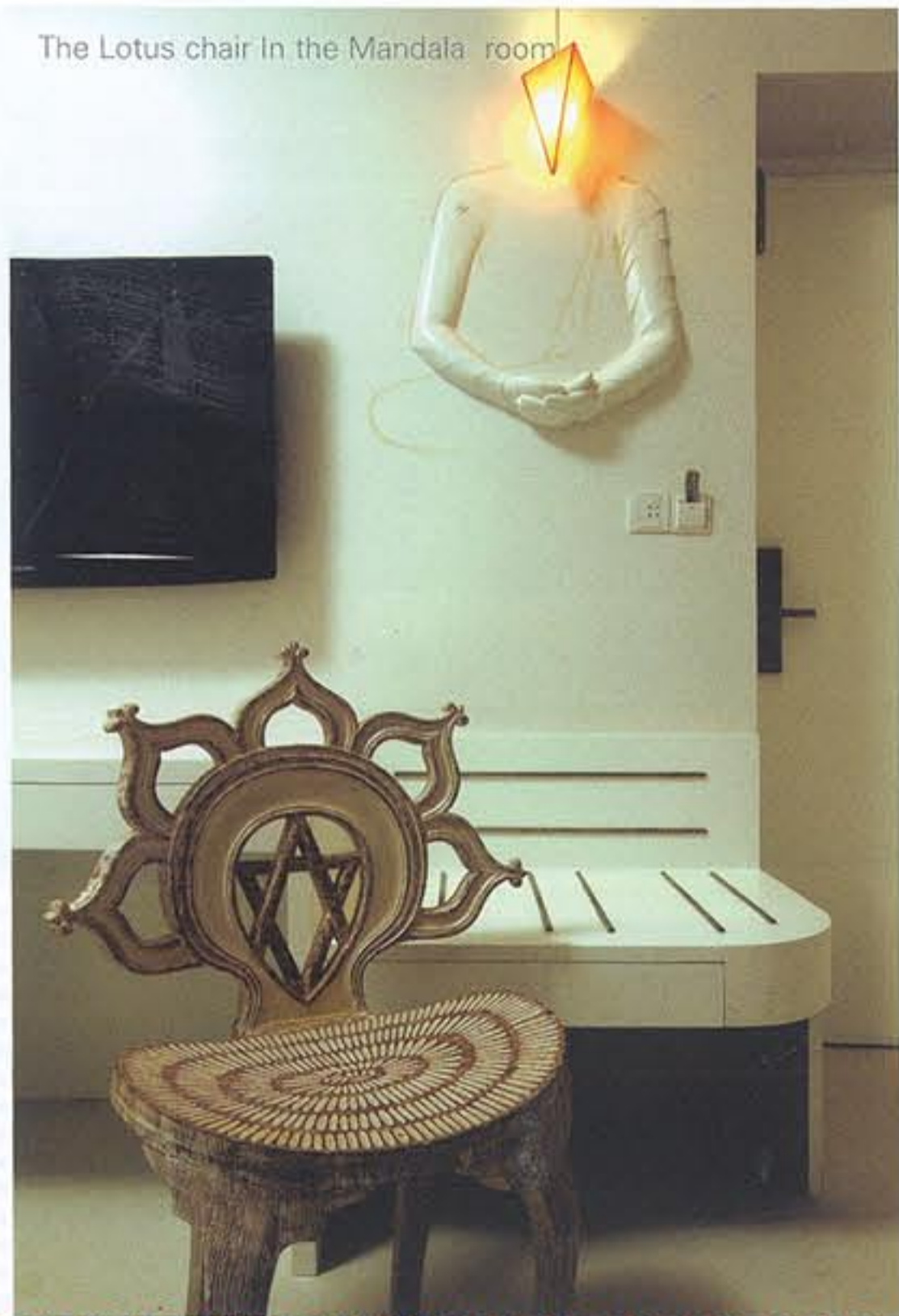
The Lotus chair in the Mandala room

Making headway among cutting edge Indian design houses is Mumbai based Dr. Art + Design (D.A.D.). A team of designers, architects, artists, sculptors and the like, Dr Art + Design is a