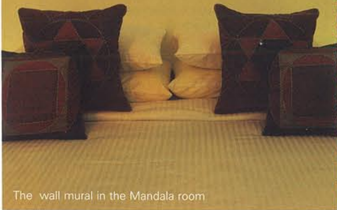
The wall mural in the Mandala room