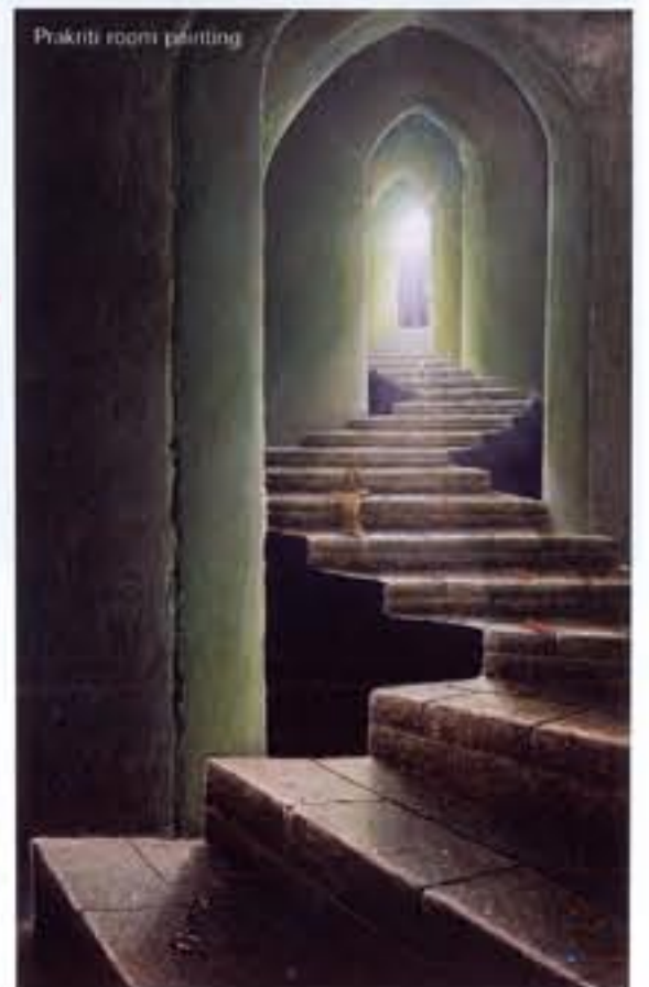
Prakriti room painting