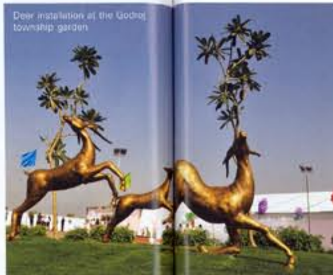
Deer installation at the Godrej township garden